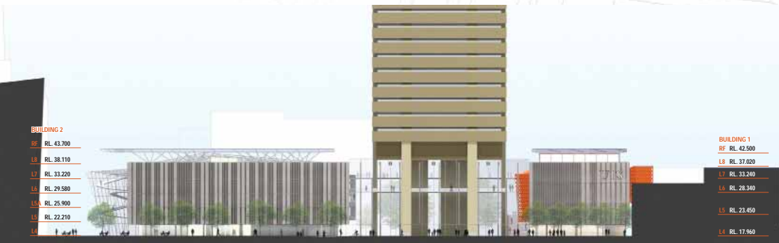
SOUTH ELEVATION 1:500

New Campus Heart LARGER ALUMNI GREEN RICH CAMPUS EXPERIENCE SEAMLESS CONNECTIONS LEVEL 3 ALUMNI GREEN 1:500