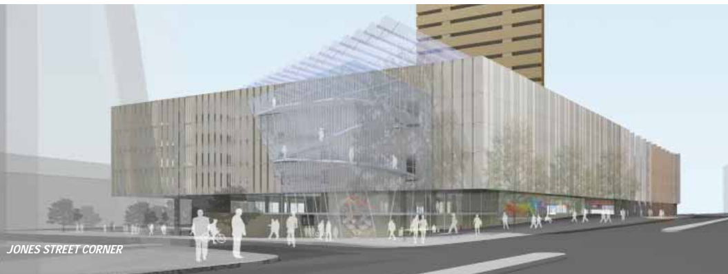
JONES STREET CORNER

LEVEL 7 LEARNING COMMONS & CHANCELLERY 1:500